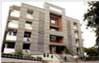
MSD WELLCOME TRUST HILLEMANN